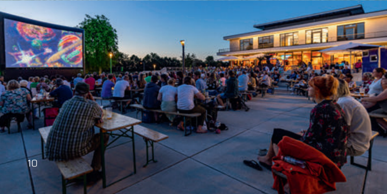
Water sports center: Center for water sports enthusiasts and mee- ting area for everyone