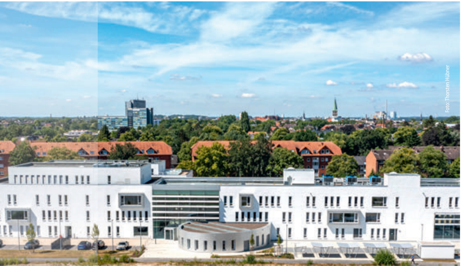
Innovation center: Space for ideas