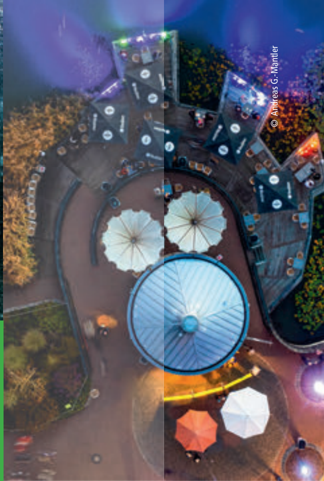
Castle of Oberwerries