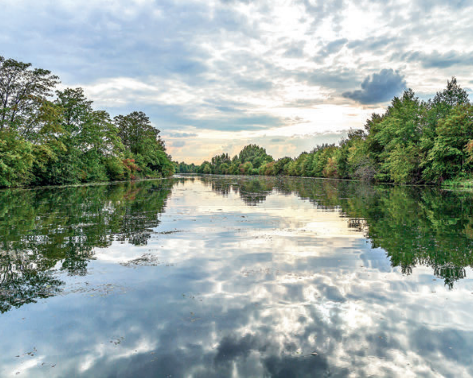
Nature reserve Lippe floodplain